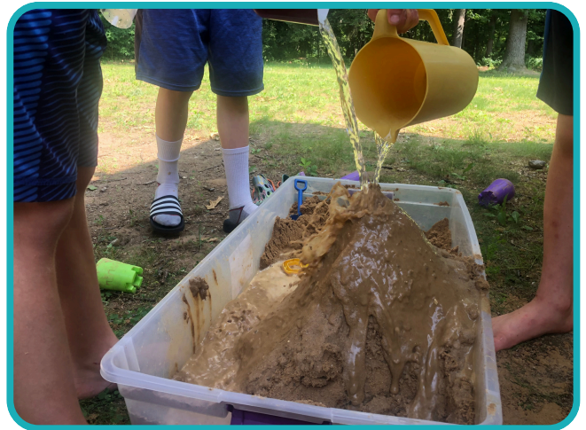
Our city destroyed by the boiling pot.