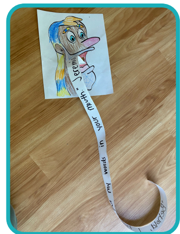
Our completed craft